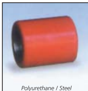
Polyurethane / Steel