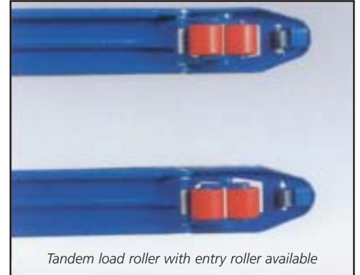
Tandem load roller with entry roller available