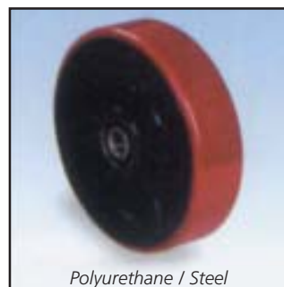
Polyurethane / Steel